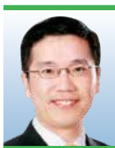
副主席 Deputy Chairman