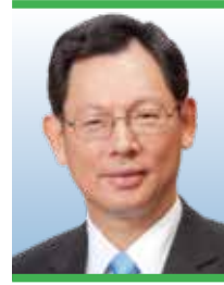
榮譽會長 Honorary President 陳德霖先生 , GBS, JP, FHKIB 香港金融管理局 總裁 Mr Norman T L CHAN , GBS, JP, FHKIB Chief Executive Hong Kong Monetary Authority