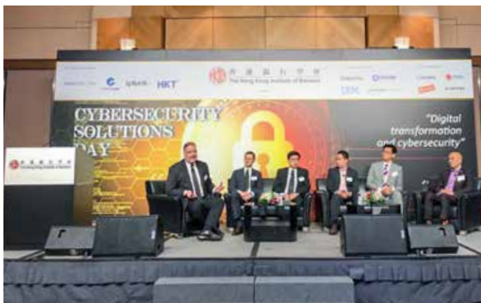
專題小組以「新的網絡安全挑戰以及行業應如何應對」為題進行小組討論。 Panel Discussion on "New Cybersecurity Challenges and How the Industry Should Address Them".

The HKIB Cybersecurity Solutions Day has always been a popular event and 2018's session was no different. The 3 rd Annual HKIB Cybersecurity Solutions Day was held on 7 March 2018 at the Hong Kong Convention and Exhibition Centre (HKCEC) with "Digital Transformation and Cybersecurity" as the theme. Over 400 attendees gathered to learn qualitative knowledge and technology solutions for the banking and finance sector, which enhanced their cybersecurity awareness, preparedness and regulatory compliance.