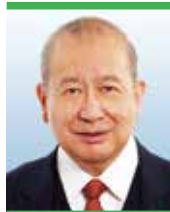
李國寶博士 , GBM, GBS, JP, Hon. Fellow (HKIB) 東亞銀行有限公司 主席兼行政總裁 Dr The Hon David K P LI , GBM, GBS, JP, Hon. Fellow (HKIB) Chairman and Chief Executive The Bank of East Asia, Limited