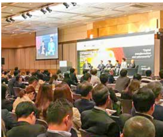
逾 400 人出席是次研討會。 Over 400 participants joined the conference.

業界對網絡安全資訊的需求殷切，學會於 2018 年 3 月 7 日假香港會議展覽中心舉辦了「第三屆網絡安全解決方案日」，主題為「數碼轉型與網絡安全」，超過 400 位人士出席。與會者對講者分享的銀行和金融知識和技術解決方案作出高度評價，更加強了他們對網絡安全和合規的準備。