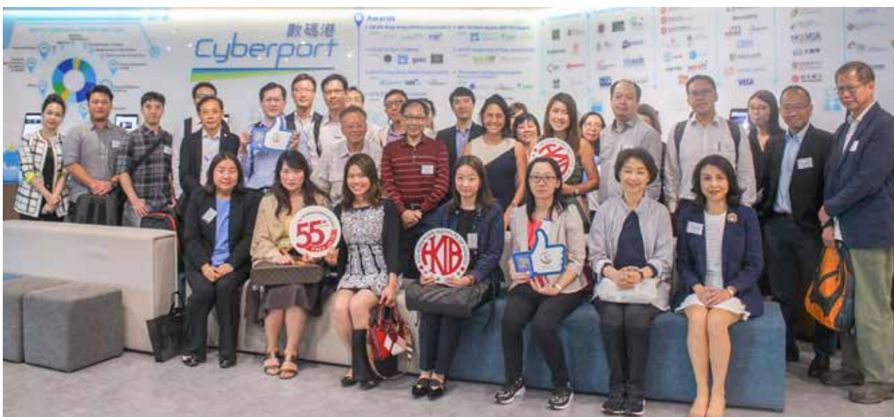
會員在活動中留影。 Members gathered for a group photo at the event.

As part of the Fintech series, the Institute organised a tour to Cyberport to keep members abreast of recent developments in Fintech. Nearly 40 members joined the tour where they had the opportunity to hear from a number of representatives from Fintech start-ups.