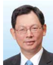
榮譽會長 Honorary President